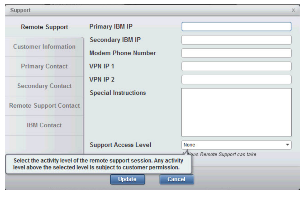
Figure 1. Support Access Level setting