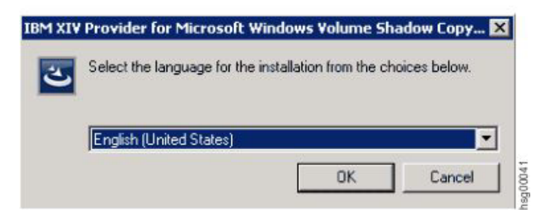
Figure 2. IBM XIV VSS Provider Installation Wizard Language panel

2. Select your preferred language, and click OK.